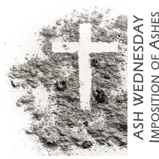
FEBRUARY 22 - 7:00PM

February 5: Fifth Epiphany - Communion ~ Scripture: 1 Corinthians 2:1-12 [13-16]; Matthew 5:13-20