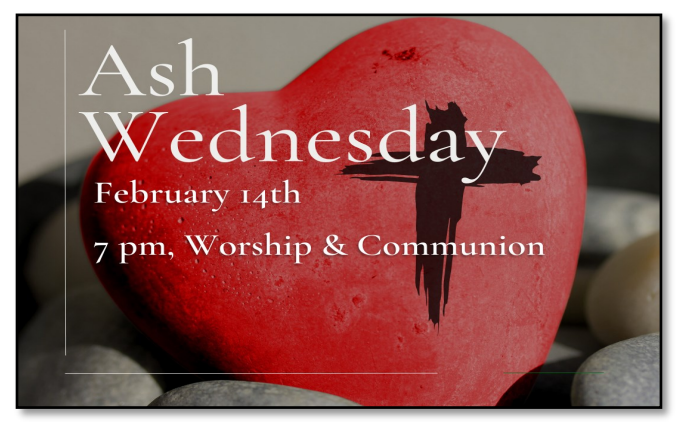
We, like many churches, use ashes during the Ash Wednesday

worship in a ritual called the Imposition of Ashes . In this custom, ashes are mixed with a small amount of oil and applied to the forehead of each worshipper. In the Ash Wednesday bulletin these words are written: Earth to Earth, ashes to ashes, dust to dust.