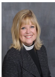
From the Spirit, January 2023