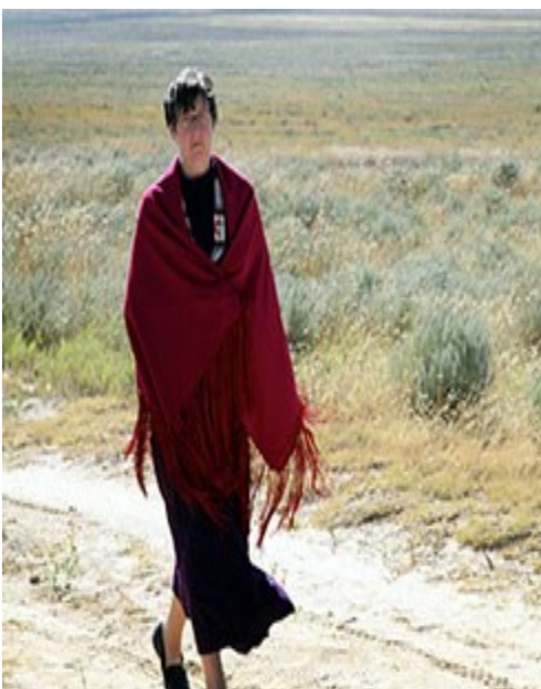
BELOW: Bishop Stanovsky visits the site of the Sand Creek Massacre in 2009 as part of an ongoing effort to tell the truth and make reparations.